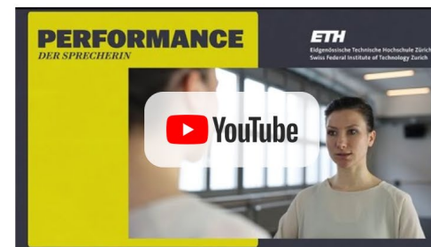
Präsenz vor der Kamera - warum ist das so schwierig? 2021