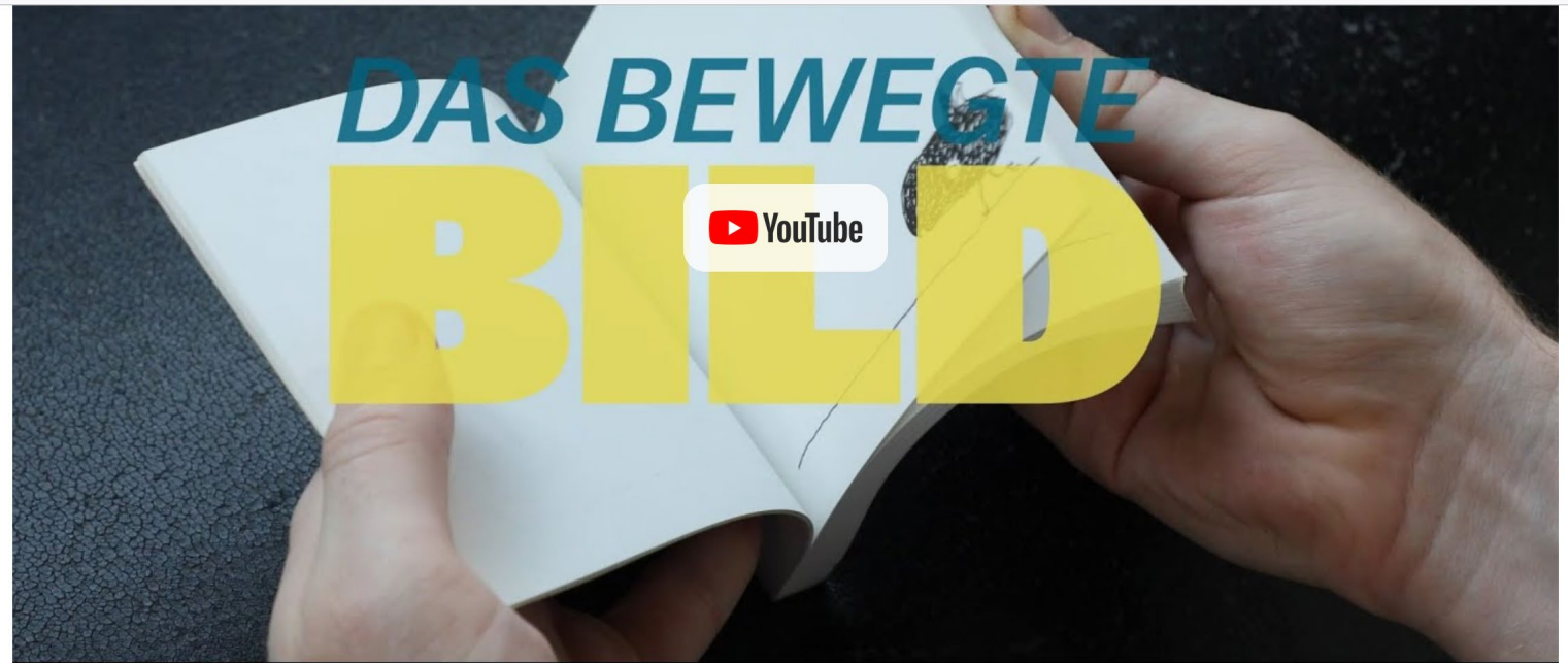
Audiovisuelle Wahrnehmung - oder wie funktioniert Video? 2021

Look for: Educational Media LET ETHZ, Digital Skills