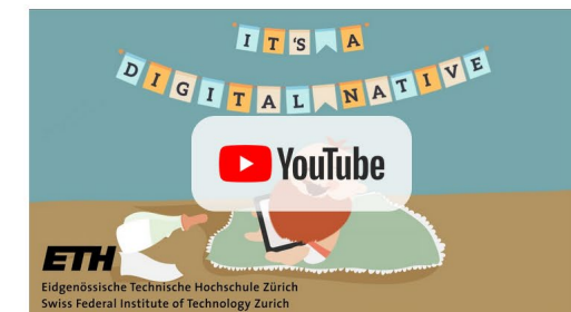
Lehr- und Lernkulturen in einer globalisierten, digitalen Welt